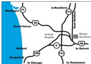
Route from Meijer Gardens to Downtown Grand Rapids = 5 miles

This summer come to Grand Rapids, Michigan to experience Tom Otterness in Grand Rapids: The Gardens to the Grand .