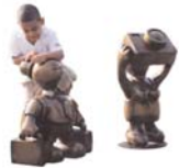
Female Tourist, Male Tourist County Courthouse