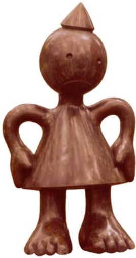
Mad Mom Meijer Gardens

The Frederik Meijer Gardens and Sculpture Park is proud to present Tom Otterness in Grand Rapids: The Gardens to the Grand a public exhibition for Grand Rapids, Michigan that includes 40 bronze sculptures installed throughout the galleries and grounds of Meijer Gardens & Sculpture Park and along the pedestrian