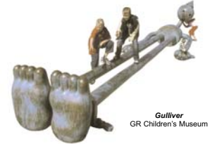
Gulliver GR Children's Museum