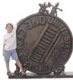
Big Big Penny Welsh Auditorium