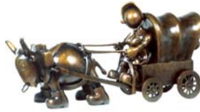
Large Covered Wagon Center of Gillett Bridge

The Frederik Meijer Gardens and Sculpture Park is proud to present Tom Otterness in Grand Rapids: The Gardens to the Grand a public exhibition for Grand Rapids, Michigan that includes 40 bronze sculptures installed throughout the galleries and grounds of Meijer Gardens & Sculpture Park and along the pedestrian